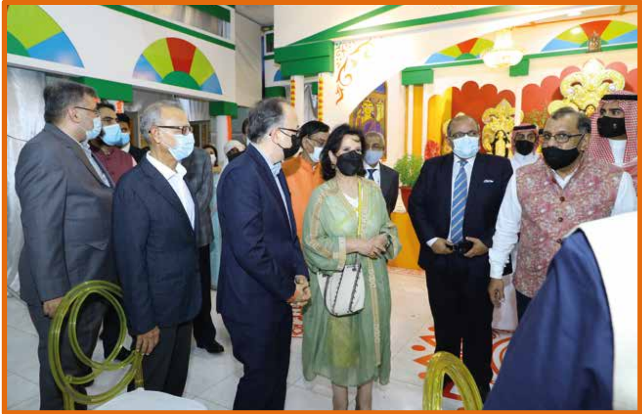
H.E. Sh Mai Bint Mohammed Al Khalifa at the THMC complex - Manama